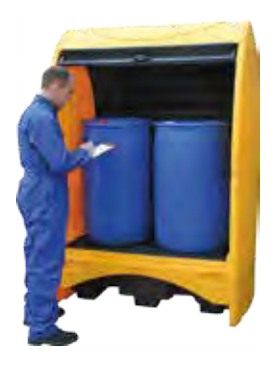
Code: 92195 2 Drum all-weather spillpallet with roller-shutter door Capacity: 250 litres Size: 157 x 100 x 211cm