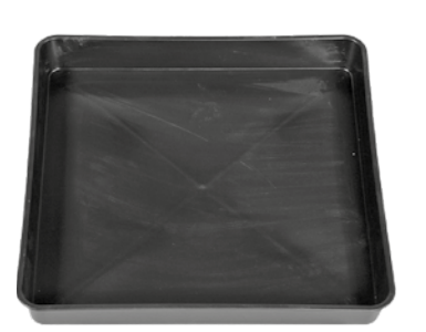
Code: 93049 Large square drip tray Capacity: 28 litres Size: 60 x 60 x 7cm