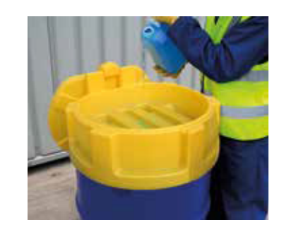
Code: 92199 Drum funnel with hinged lid