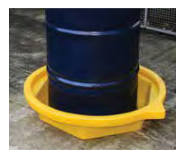
Code: 93105 Drum tray with pouring spout