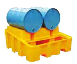
Code: 93062 2 Drum Base Capacity: 450 litres Size: 135 x 137 x 51cm