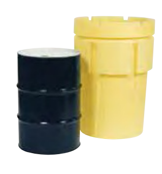
Code:93118 Overpack drum for distorted or bowed drums Sump capacity: 399 litre drums