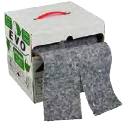
Code: 93088 EVO absorbent roll in dispenser box Dimensions: 38cm x 20M Absorbency: 49 litres Quantity: 1

Code: 93085 EVO absorbent roll in dispenser box Dimensions: 30cm x 30M Absorbency: 58 litres Quantity: 1